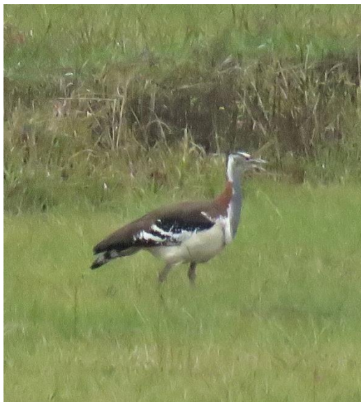
Figure 4 Denham's bustard.

After four weeks I stood on 23 full protocol cards in 20 pentads, and I logged 184 species and 1752 observations on Birdlasser.