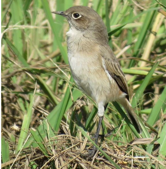
Figure 6 Sickie-winged Chat – a lifer for this subproject!

Once more unto the breach... with pentad 2710_2925 delivering a pair of Secretarybirds , a pair of Grey Crowned Cranes and a pair of Denham's Bustards ! I felt a bit conflicted about the latter, as the road I observed them from, forms part of my CAR count route and I have never recorded them during a CAR count. The next day I set out to turn the last two pentads green and was rewarded with a Rock Kestrel , another winter special. The last morning I made a rather nostalgic visit to my late grandparent's farm, I recorded a Purple Heron and only my second ever sighting in the WSA of a Golden-breasted Bunting , the first being five years ago in the same month and the neighboring pentad!