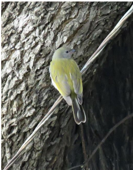
Figure 2 One of the Lesser Honeyguides spotted in the garden from my desk

After two weeks I had already done 14 full protocol cards, logged over 1000 observations on Birdlasser and the 150 species mark was not far. But I knew I had to go to the southernmost pentads of the WSA to keep the list ticking over.