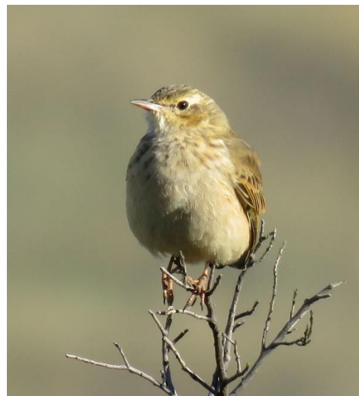
Figure 5 Long-billed (Nicholson) pipit.

One last throw of the dice in my home pentad delivered a few small groups of Orange-breasted Waxbill and Wattled Starling , both winter specials for the WSA. On a cold, wet and windy morning, I reluctantly headed out to a nearby pentad on the edge of the Grootdraaidam that has the habit of delivering vagrant species, stopping at a locked gate with a mist rain setting in, I had all but given up. Soldiering on, I felt rather bemused to find a pair of African Black Ducks in a recently harvested soybean field, but my eye caught movement in the background. Not one...Not two... but five Denham's Bustards ! The rarest of the endangered species in the WSA with a reporting rate of only 0.6%!