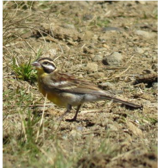
Figure 7 A special sighting of a Golden-breasted Bunting

During my six-week solo bash I submitted 34 full protocol cards in 26 pentads, with 191 species and 2236 observations logged on Birdlasser. I also drove about 2000km!