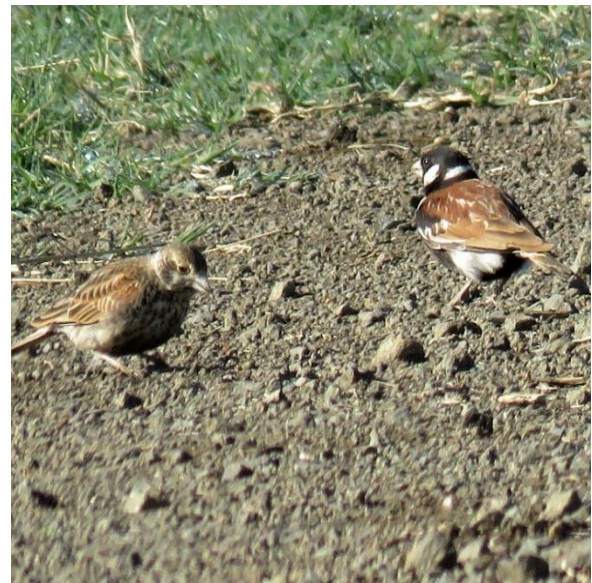
Figure 3 Chestnut-backed Sparrowlarks