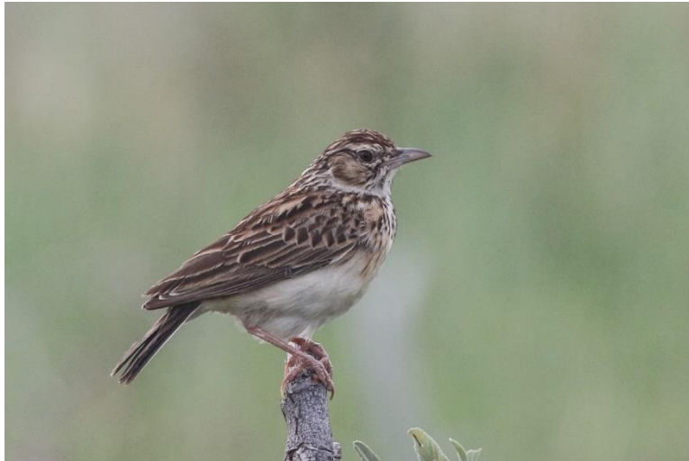
Figure 2 Some stars of the trip! From top left: Cape Penduline Tit at its nest, Northern Black Korhaan in full cry, Black-chested Prinia and a Sabota Lark

Special sightings included fair numbers of Double-banded Courser, Temminck's Courser, Burchell's Sandgrouse, a single Namaqua Sandgrouse, dozens of South African Shelduck at the main Heuningvlei Pan, Olive-tree and Icterine Warbler, and a good selection of raptors that included Pale Chanting Goshawk (many), Martial Eagle, Common Buzzard, Gabar Goshawk (several), Shikra, Lanner Falcon (several), Tawny Eagle, Lesser and Greater Kestrel,