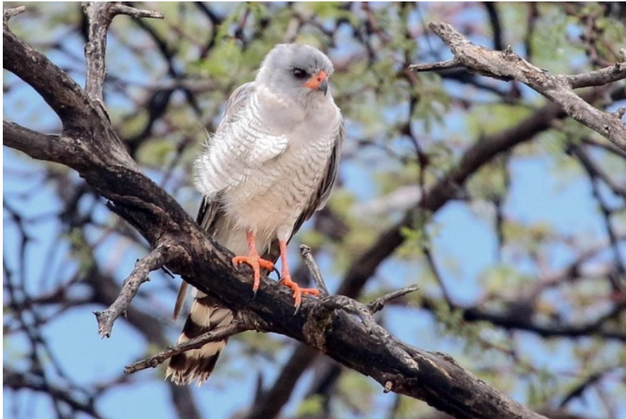
Figure 3 Gabar Goshawks were encountered on a number of occasions.

Perhaps the most enduring memory was the stunning display of larks, cisticolas (primarily Desert and Tinkling) and pipits in full song after the good rains. An amazing 10 lark species was identified; namely Rufous-naped, Sabota's, Fawn-coloured, Monotonous (in great numbers), Red-capped, Eastern Clapper, Melodious, Spike-heeled, and Chestnut-backed and Grey-backed Sparrowlark. On one morning 9 larks were found in one two-hour visit to a single pentad!