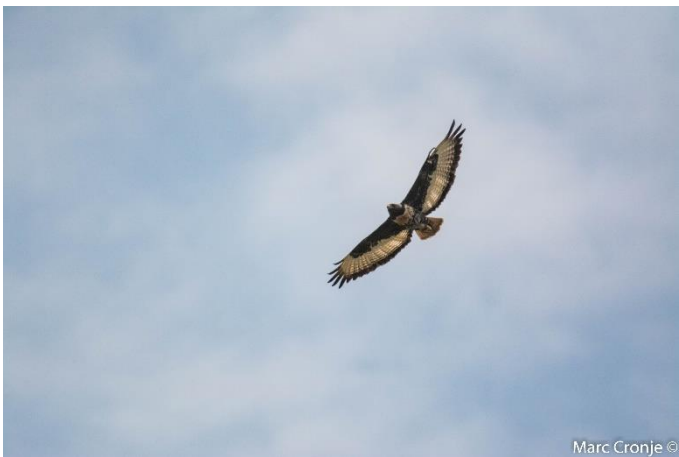
Marc Cronje ©